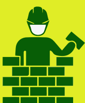
READY TO CONSTRUCT