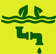
GOOD GROUND WATER