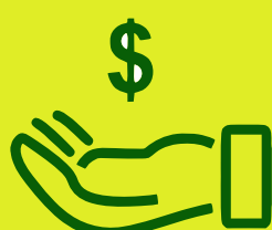
BANK LOAN ARRANGED